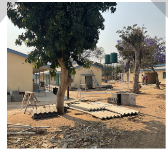
Rural Clinics- 2013