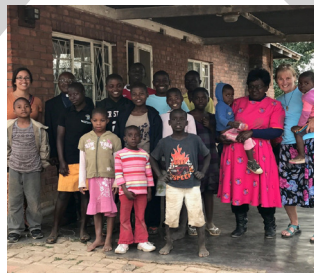
Home of Hope- 2006