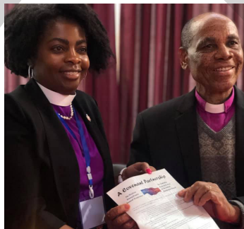
Partnership Signing- 2019