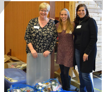
Girl Empowerment- 2010

Volunteer-in-Mission (VIM) program started