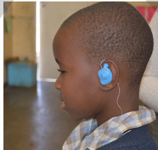
Hearing Innovation- 2016