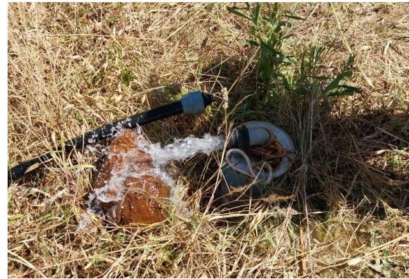
Water flows from a new, solar-powered bore hole at the Home of Hope orphanage.