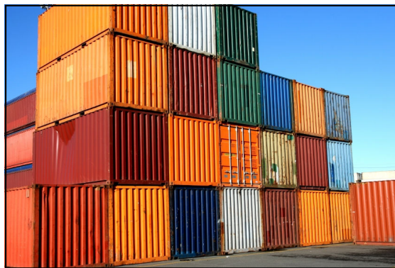
Ocean-going containers ready for shipping

The container sent through Brother's Brother is entirely for Nyadire and includes things for the Mission in general as well as items specifically for the Hospital.